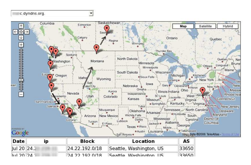
Fig. 2. Tracking a user's summer road-trip through the DNS

a dial-up ISP whose proxy servers are located in Reston, Virginia; fundamental limitations of geolocalization pertaining to proxies are explained in [3]. M runs a local firewall configured to filter all inbound packets. Unfortunately, we were unable to disambiguate M's real identity enough to contact him for verification.